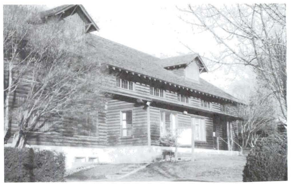
Des Moines Fieldhouse Park is scheduled to be closed to the public by King County.

The annual budget represents the single most important series of decisions made by the City Council in any year. The conclusions reached during the budget process will determine the quality of public service to be provided and contributes to the quality of life for Des Moines residents.